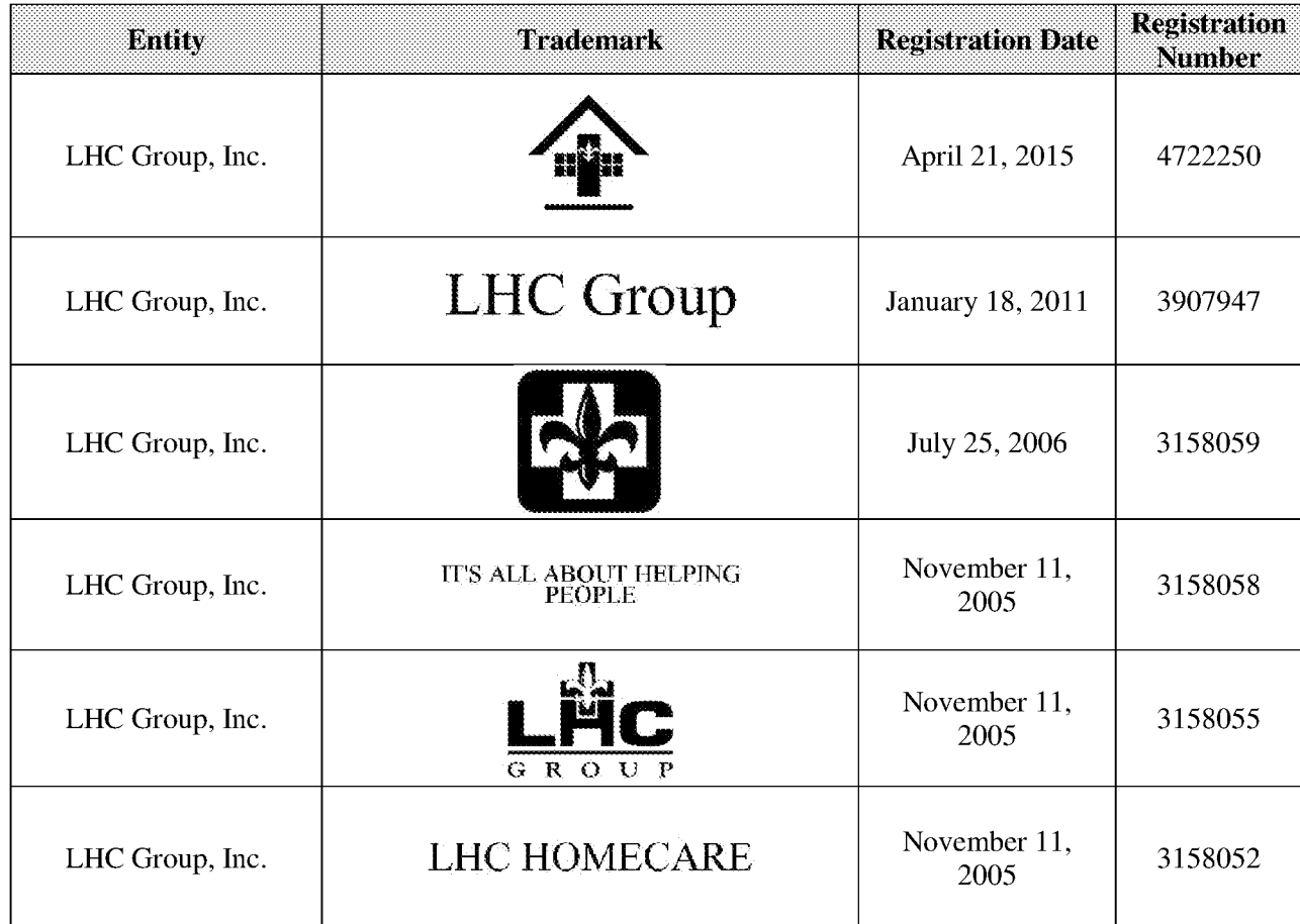
Exhibit A - SCHEDULE OF TRADEMARKS