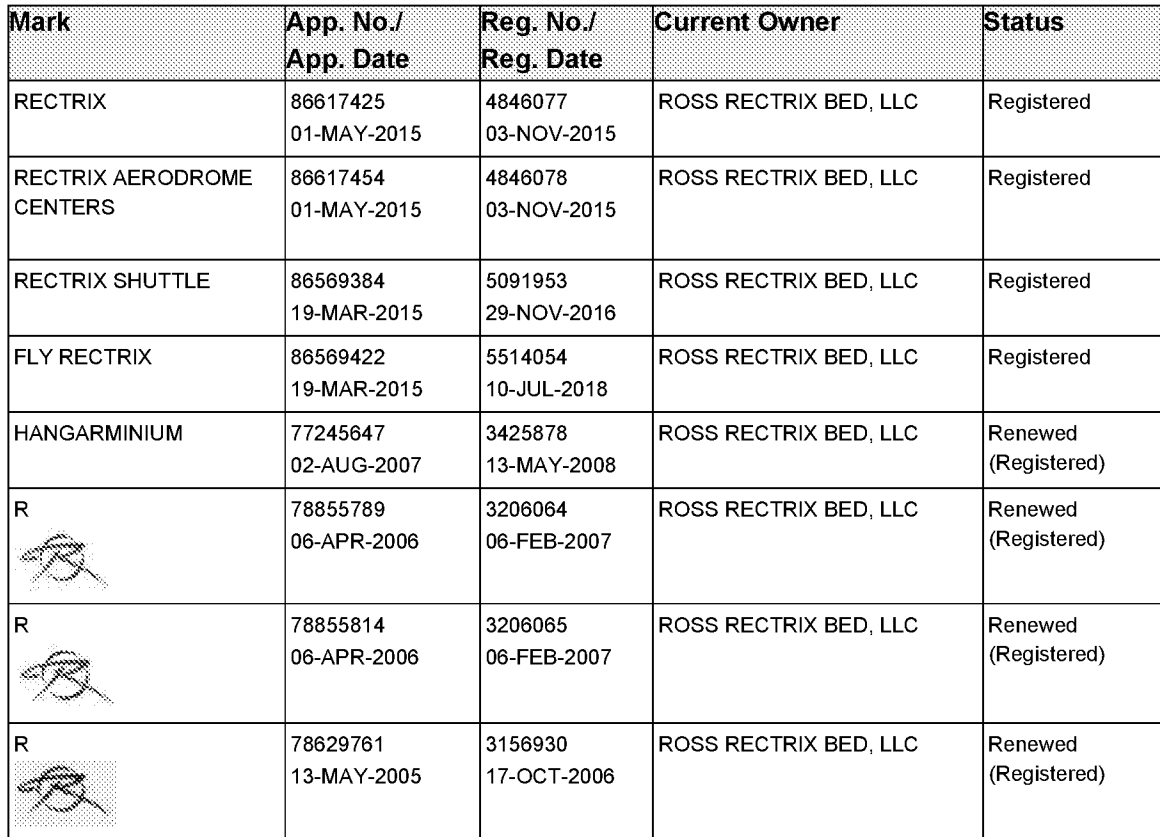
Exhibit A - SCHEDULE OF TRADEMARKS