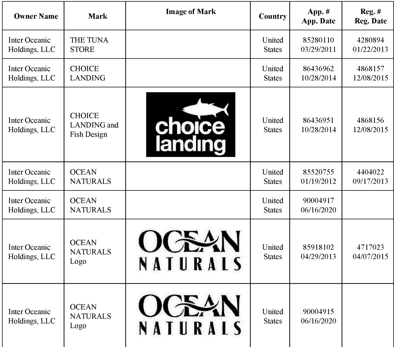
EXHIBIT A - United States Trademarks