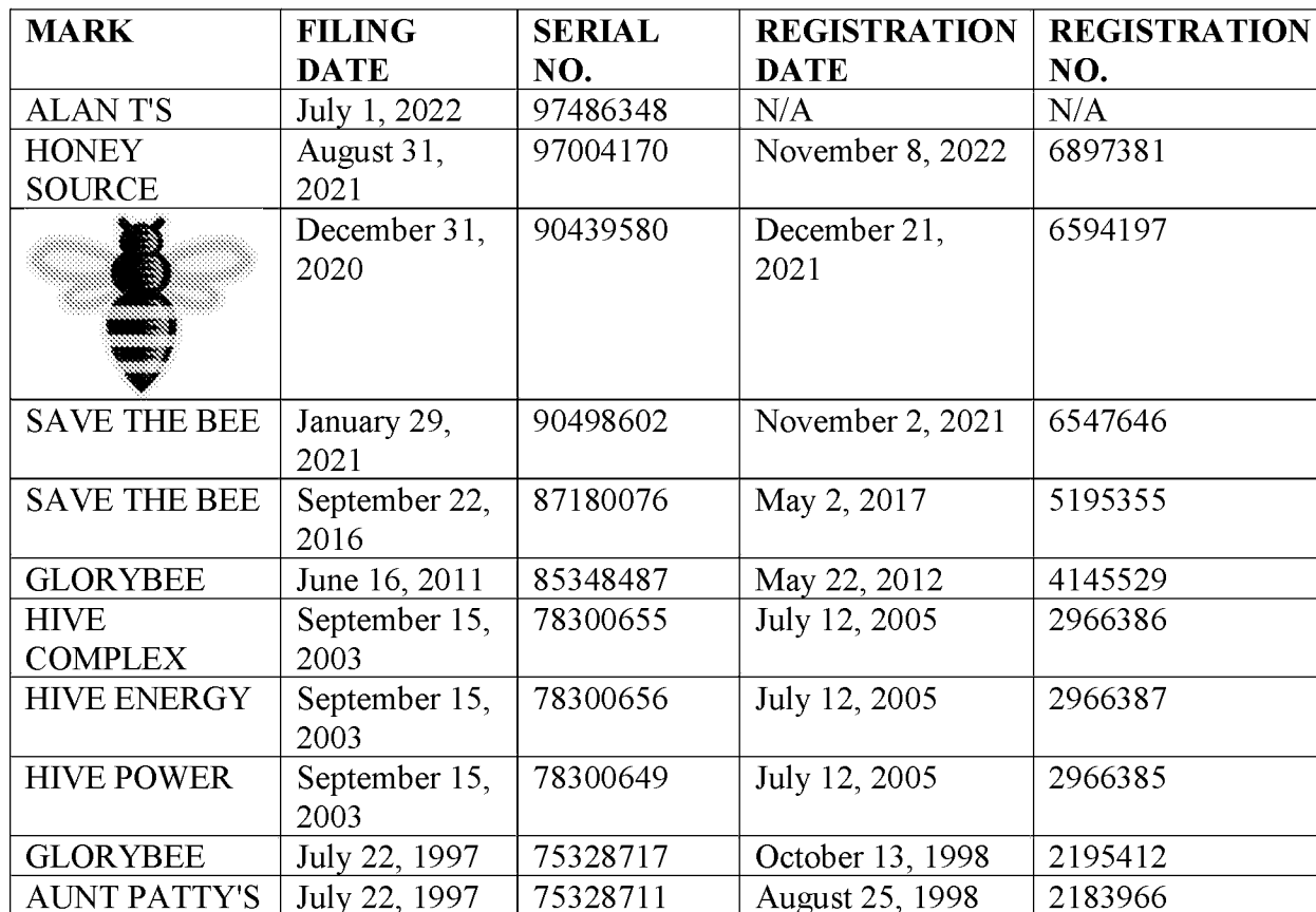
EXHIBIT C TRADEMARKS