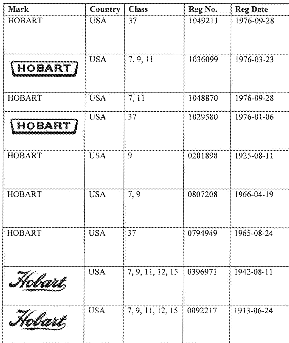
Exhibit A to Trademark Assignment from PREMARK FEG LLC to Illinois Tool Works Inc.