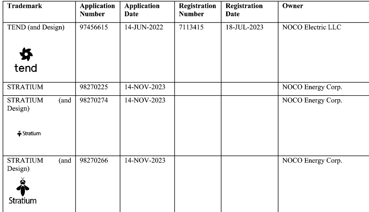
Exhibit A – SCHEDULE OF TRADEMARKS